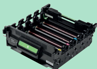
Drum Unit DR645CL