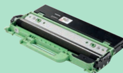
Waste Toner Box WT229CL