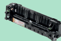
Fuser Unit FD-5000