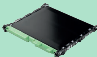
Belt Unit BU635CL