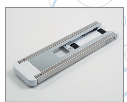
Minimum space with storing flat mechanism