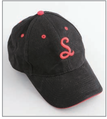
Embroider over a wider area