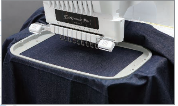
Cloth outside the frame is kept on top of the frame and out of the way