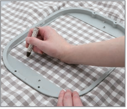
The square shape of the frame also makes it ideal for planning quilt designs

Square frame to make aligning quilt patterns and other embroidery positions easy