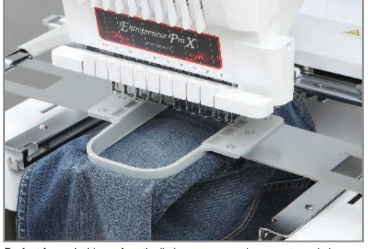
Perfect for emboidery of vertically long areas such as pants and sleeves