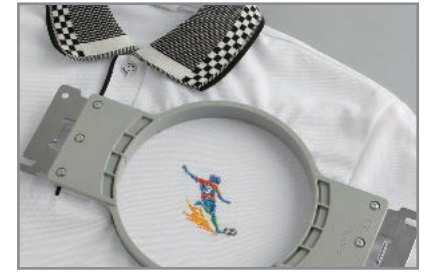
Easily adjust designs that need to be properly aligned