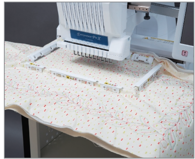
Good for quilt sashing, too