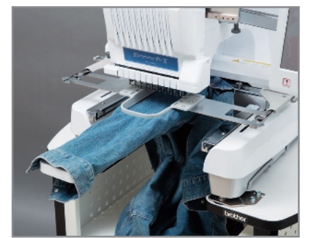
Supporting heavy tubular materials stable