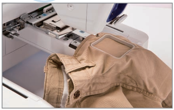
Embroidery is possible even in small spaces such as pockets, and support for automatic frame detection ensures both safety and peace-of-mind