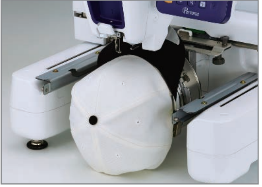
Set completed cap directly onto the machine