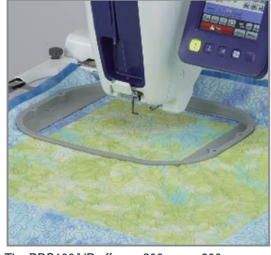
The PRS100/VR offers a 200 mm x 200 mm sewing range