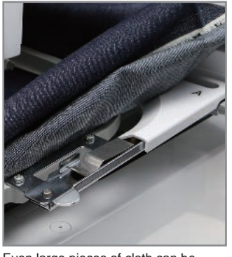
Even large pieces of cloth can be released to the upper side of the arm