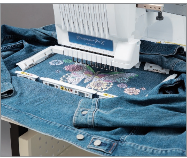
Keep thick materials