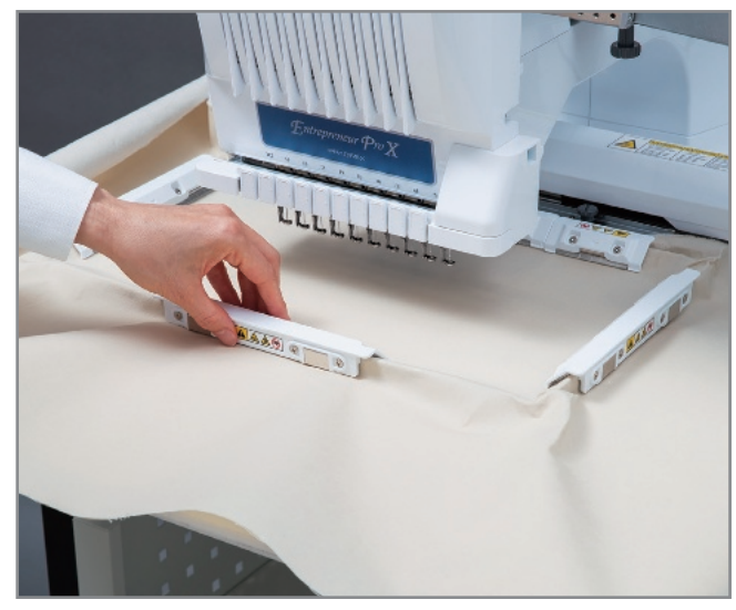
Easy hooping, only put magnet pieces