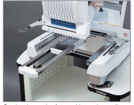
One hand operation for attaching and extending