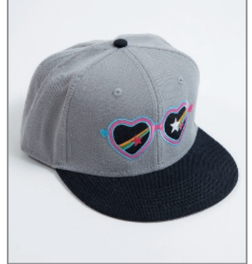
More wide range of caps can be used