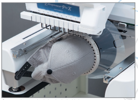
Can go close to the brim, incleded brim cover