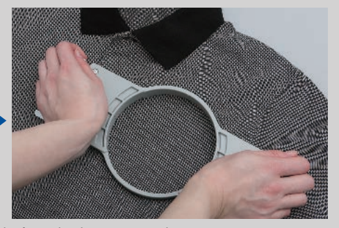
Set the garment in any direction, as long as the center of the frame is where you want it