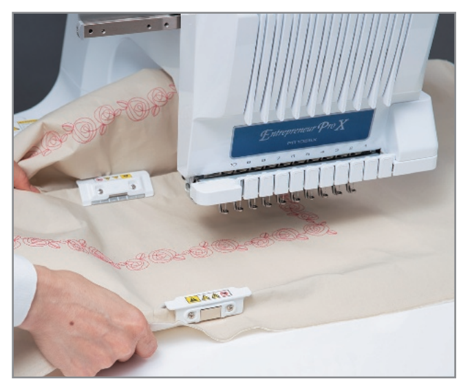
Easy to connect pattern, only slide the material