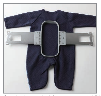
Can also be used for infant rompers and children's shirts