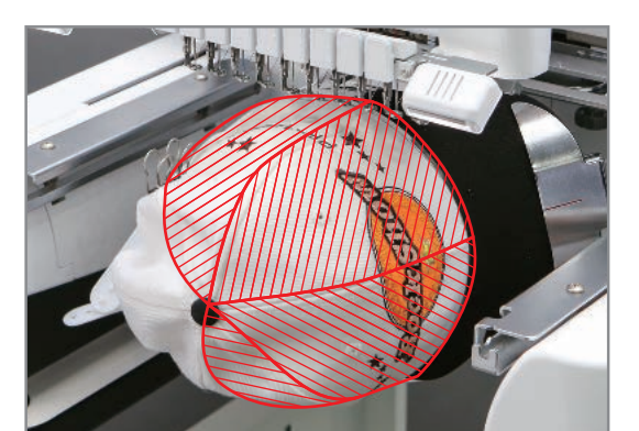
Embroider right up to the edge