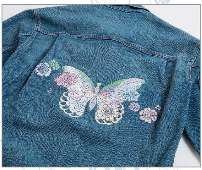
Wide embroidery area