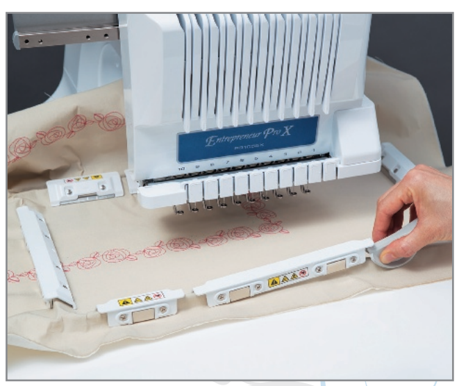
Included Leverage magnet lifter, easy to remove the magnetic pieces