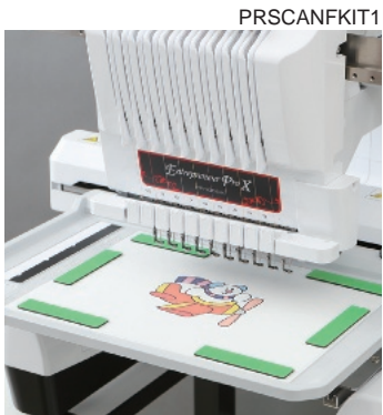
Bobbin Winder PRBW1