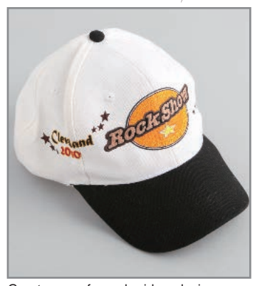
Greater area for embroidery designs