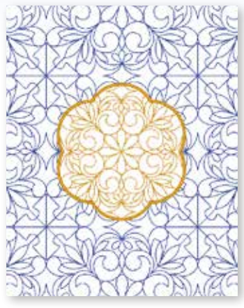
Decorative Fill Pattern